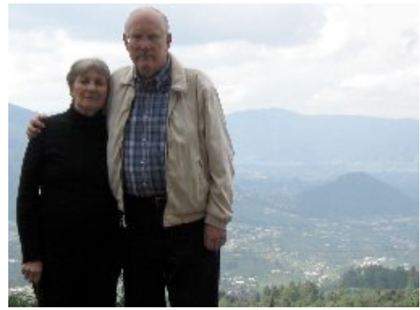
HIGH ON A MOUNTAIN OVERLOOKING TOTONICAPAN